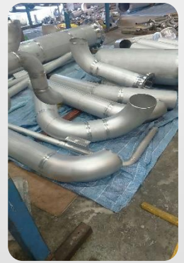
Pickling & Passivation