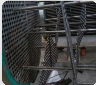
Re-Tubing in Shell & Tube Heat-exchangers