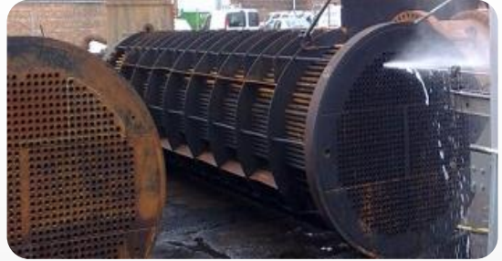
Hydro Jet machine Cleaning